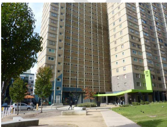
Figure 6: Café at the base of 478 Drummond Street (2017)