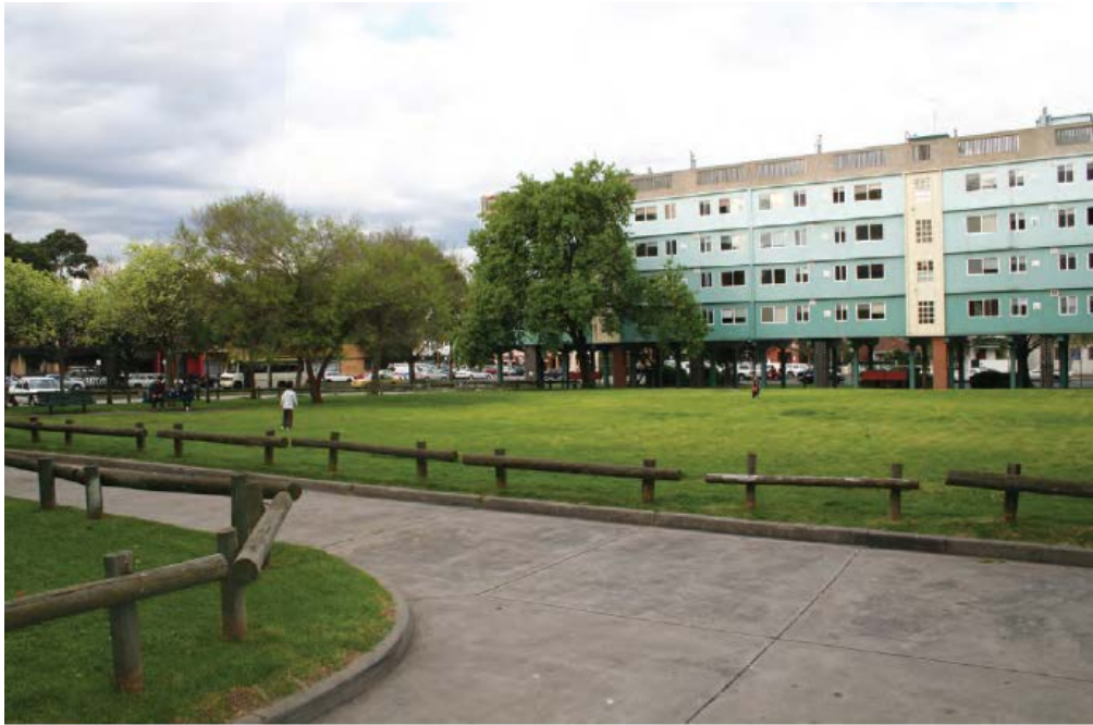
Figure 7. Former public walk-up flats at Rathdowne Street (DHS 2009).

The Carlton redevelopment was announced in December 2005 by the Labor state government (DHS 2005). The two precincts and a third former hospital site (marked 3 in figure 6) would be redeveloped in the largest mixed-tenure development yet, with all the walk-ups to be demolished and replaced with a mix of public and private housing. The project was managed by government, with Australand and the Citta Property Group as developers (DHS 2016).