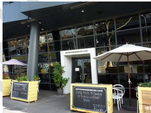
Figure 5: Café at the base of 497 Rathdowne Street (2017)