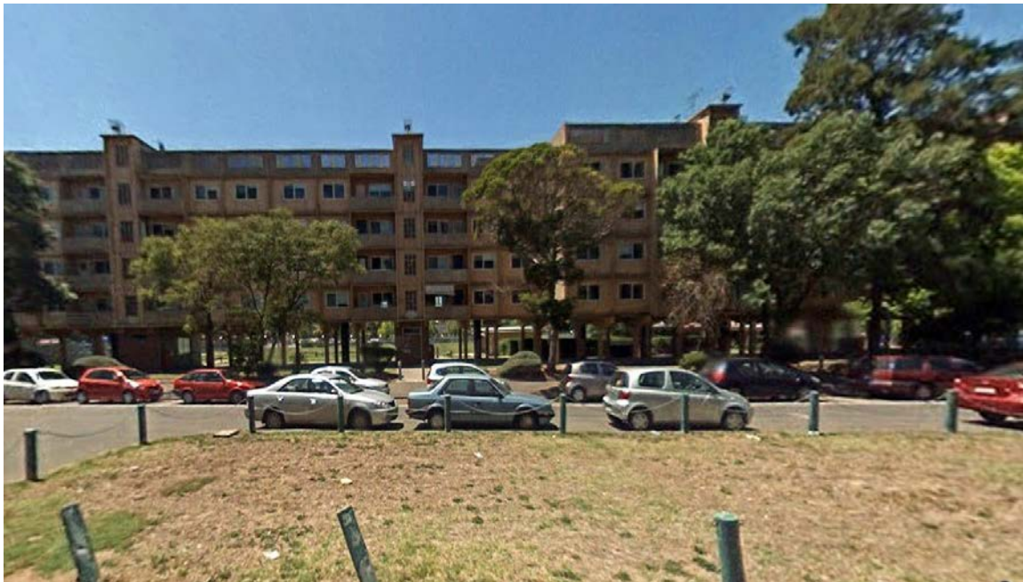
Figure 9: Walk-up flats in the Lygon/Rathdowne precinct immediately before demolition (DHS 2009)

Eight walk-up buildings at the Lygon/Rathdowne precinct (figure 9) were replaced by two higher density public housing buildings (figure 10).