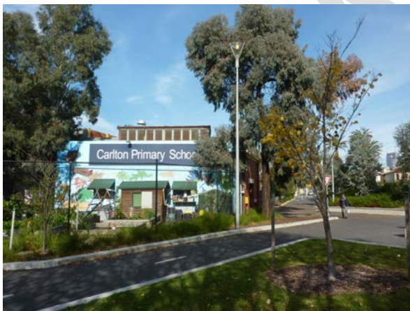
Figure 4: Carlton Farmer's market (2017) (coming)