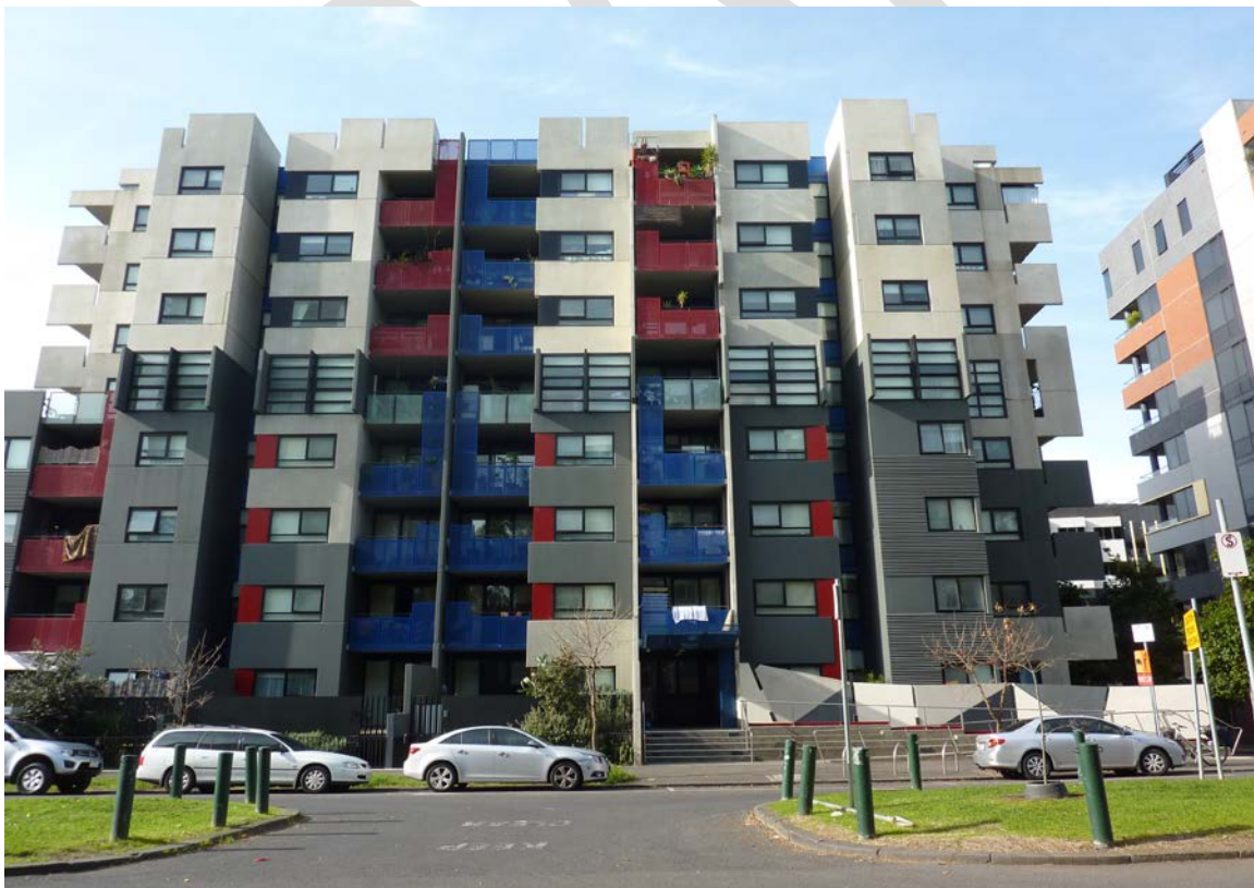
Figure 10: Replacement public units in the Lygon/Rathdowne Precinct (2017)