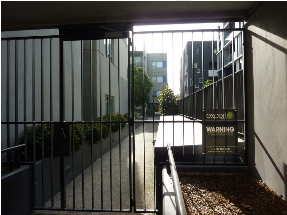
Figure 14: Private garden accessible only to private residents

The private garden is indeed completely blocked off from the public units and the street, with access by key only (figure 14).