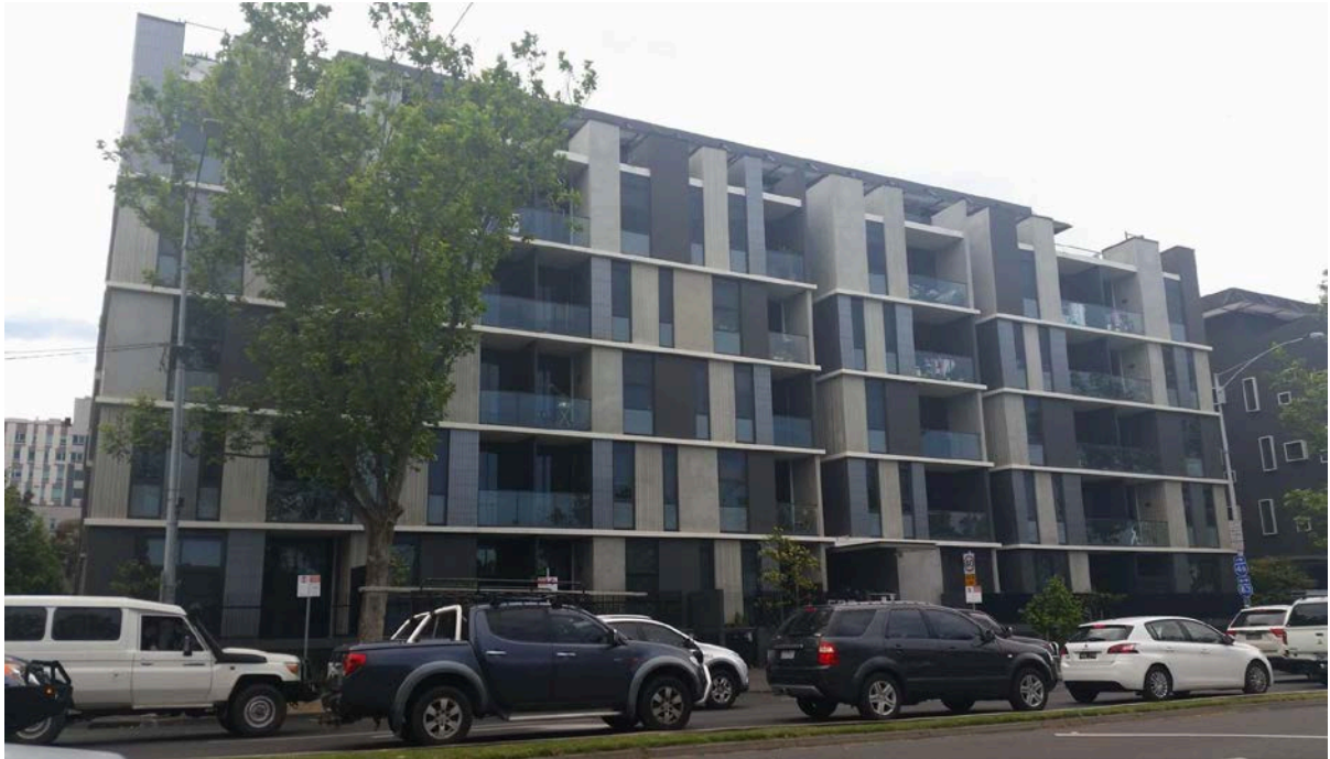
Figure 11: New private apartments at the Rathdowne/Lygon Street Precinct Street (2015)

The new public and private buildings are intended to be indistinguishable.