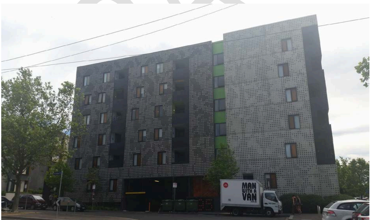
Figure 12: New public apartments at the Keppel/Cardigan Precinct (2015)