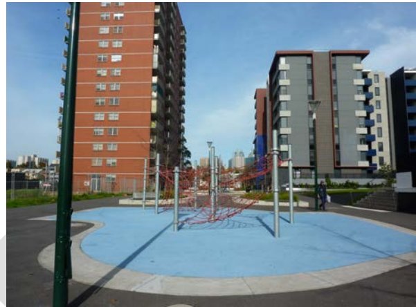
Figure 3: Elgin/Nicholson Street open space (2017)