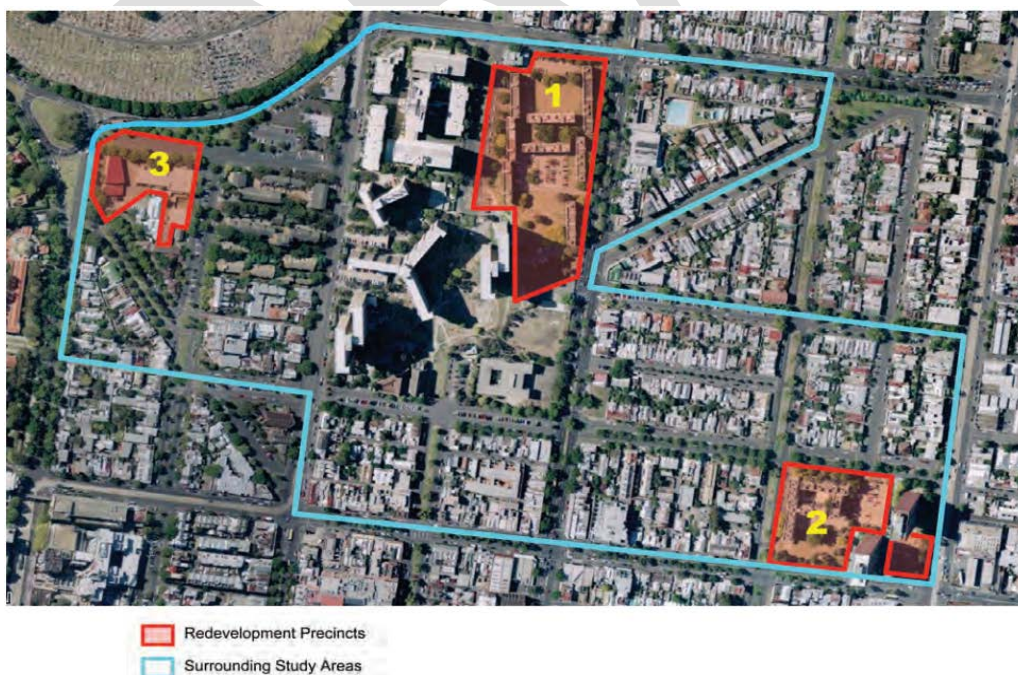
Figure 8: The three redevelopment precincts of the Carlton estate: (1) Lygon/Rathdowne precinct, (2) Elgin/Nicholson precinct, (3) the new Keppel/Cardigan precinct (former hospital site) (DHS 2009).

The Carlton redevelopment was announced in December 2005 by the Labor state government (DHS 2005). The two precincts and a third former hospital site (marked 3 in figure 6) would be redeveloped in the largest mixed-tenure development yet, with all the walk-ups to be demolished and replaced with a mix of public and private housing. The project was managed by government, with Australand and the Citta Property Group as developers (DHS 2016).