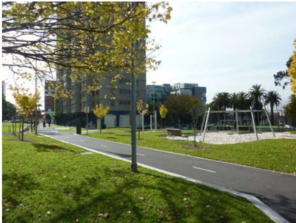
Figure 2: Drummond Street open space (2017)

Carlton Farmers Market at the Carlton Primary School (figure 4), the cafés at 497 Rathdowne Street (figure 5) and 478 Drummond Street (figure 6). These five spaces were selected because they are the most frequented and open to all, and contain facilities (playgrounds, green space, cafés and market facilities) that most naturally engender social mixing.